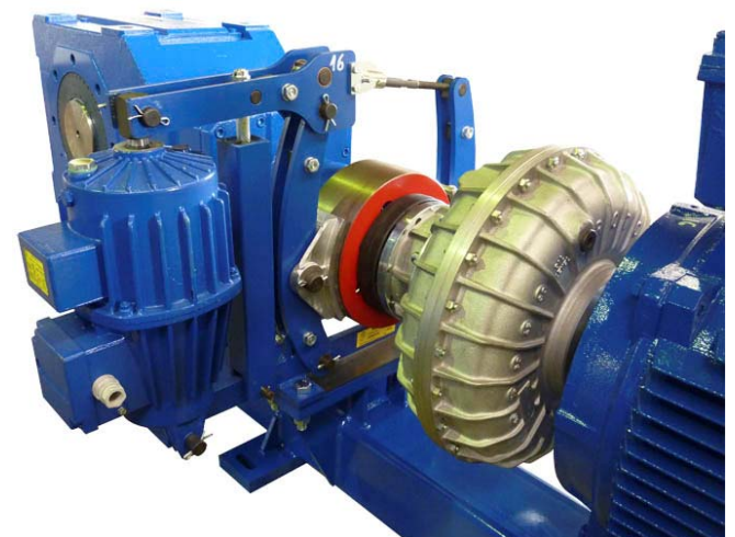
Picture 2: Helical bevel geared motor with drum brake, fluid coupling and base frame Type: KU 136A WN RSG FK 226M4

Further information concerning the Watt product programme can be obtained on our website www.wattdrive.com